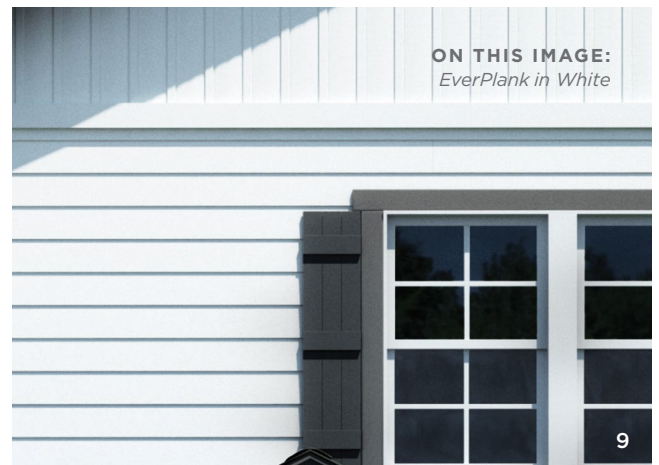
ON THIS IMAGE: EverPlank in White

Without the need for repainting, luxury vinyl siding saves an average of $1,500 PER YEAR.