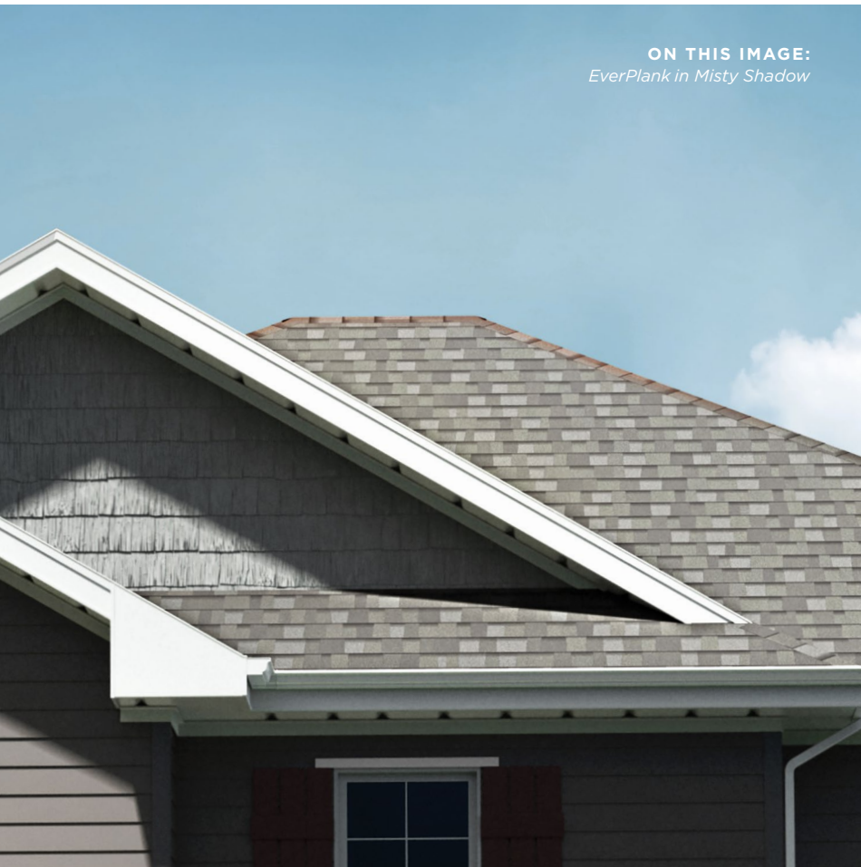
ON THIS IMAGE: EverPlank in Misty Shadow