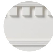
TRIM & ACCESSORIES