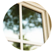
WINDOWS & PATIO DOORS