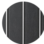
FENCE & RAILING